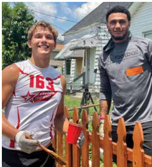
UofL football team teamed up with Habitat for Humanity of Metro Louisville

For more information on Habitat for Humanity, visit louisvillehabitat.org .