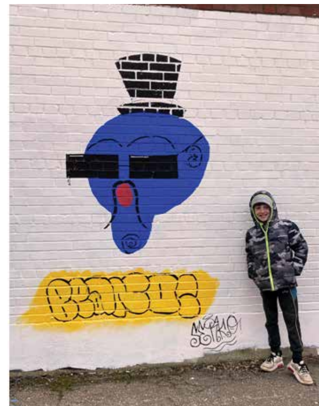
A young artist stands by his work at the LVA Free Wall in Portland.