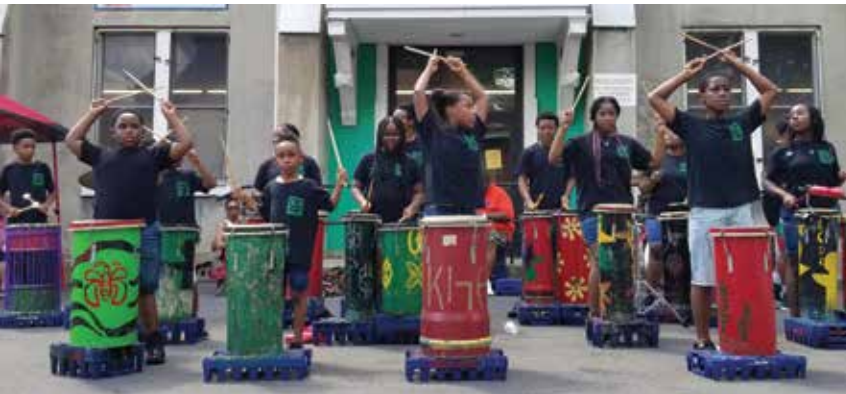
The River City Drum Corps' pipe drummers entertained the crowd in the plaza between the St. Cecilia church and a one-time school building that now houses Porkland BBQ.