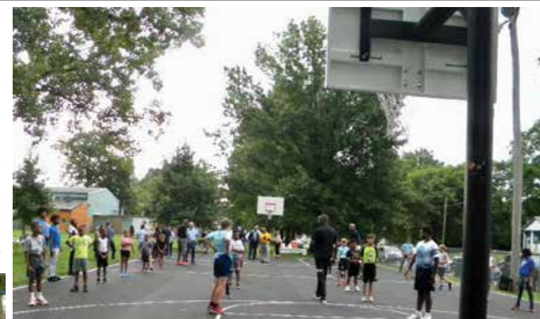
Kids in attendance for the announcement at the basketball court in Portland Park